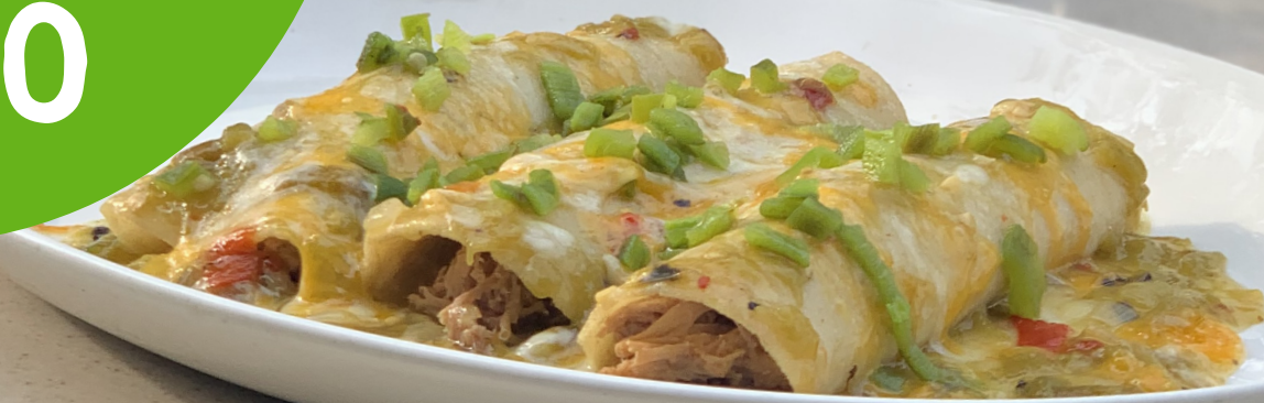
Pork Carnitas Hatch Chile Enchiladas