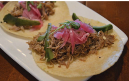
Top: Sopes are delicious disks of corn masa with a variety of toppings. Bottom: Duck Carnitas taste great with or without sauce. BRIT MOTT