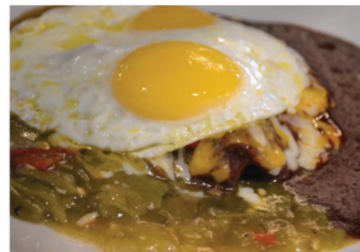
Mi Dia's Stacked Enchiladas, filled with beef or chicken and topped with two sunny-side-up fried eggs, taste anything but flat.